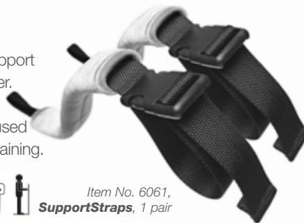
Item No. 6061, SupportStraps, 1 pair

SupportStraps are an accessory which, together with ReTurnBelt, function as lateral support for ReTurn7500/7400/7600. One SupportStrap is affixed to each side of the rising ladder. When the user is in a standing position, the other end of the SupportStrap is attached to the appropriate handle on either side of the ReTurnBelt. SupportStraps can also be used as leg harness for EasyBelt and FlexiBelt in connection with standing training and gait training.