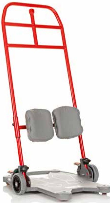
ReTurn7500 suits most adult users.

ReTurn7500 is thus the original and a success story that is sure to become a classic. To enable solutions for more situations while at the same time meeting the needs of more types of users, we have developed several more models of ReTurn. We have also made further refinements to ReTurn7500. However, the basic principle behind ReTurn remains the same: the user's own strength and ability must be utilized and improved. All models of ReTurn therefore have a couple of important features in common: they help to activate the user and they encourage the user's natural patterns of movement. They also give users the opportunity to regularly raise themselves to a standing position. Quality of life can be something as simple as the possibility to use one's own strength and functional ability.