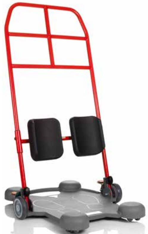
ReTurn7600 has been developed for larger and heavier users weighing up to 205 kg/450 lbs.