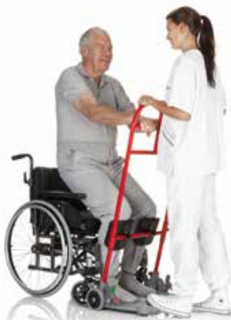
Throughout the entire sit-to-stand procedure, the caregiver must have one foot on the base plate to provide counterweight.