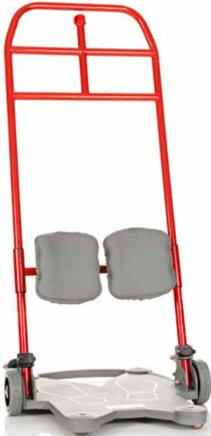
Item No. 7500i, ReTurn7500 , extra padding for lower-leg supports are included as standard