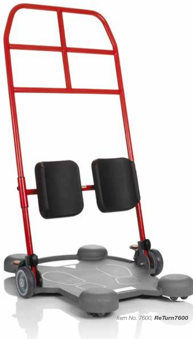
Item No. 7600, ReTurn7600