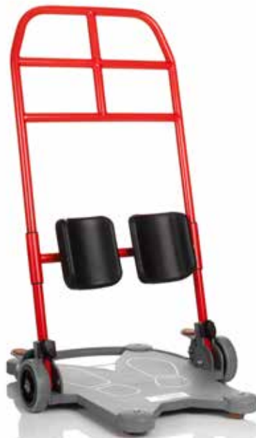
ReTurn7400 is ideal for shorter adults and children.